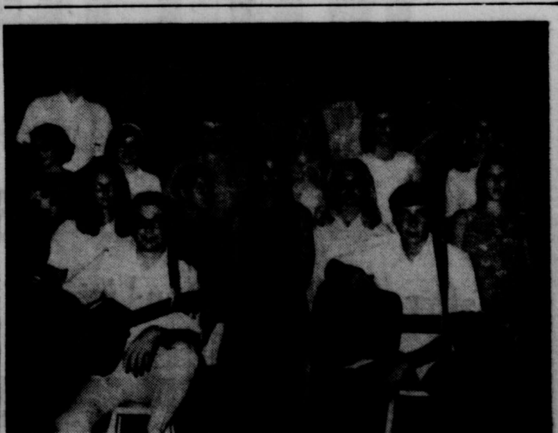
TO PRESENT PROGRAM—The young people pictured above will present a "Sing Out America" program at the Crowell High chool auditorium Saturday night, July 5, beginning at 8 o'clock.