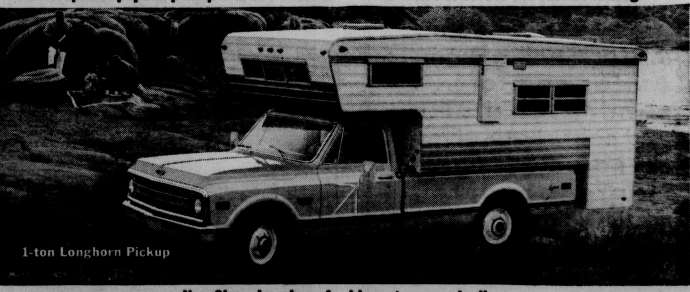
New Chevy Longhorn for biggest camper bodies.

Only a Chevrolet pickup can tally this list of advantages that add up to more value for your investment: Start with style—bold and handsome, newest in the field. Add smoothest pickup ride, the result of tough coil springs at all four wheels on most models. Plus the biggest choice of truck 6 and V8 engines in