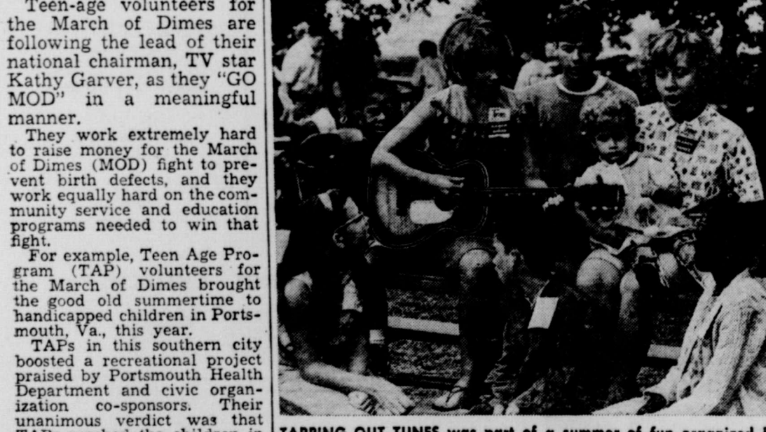
TAPPING OUT TUNES was part of a summer of fun organized by

The Portsmouth project was only one outlet for the thousands of March of Dimes TAPs who serve communities across the nation year-round. In cities, towns and rural centers they help to support the March of Dimes in its nationwide program to prevent birth defects. Since 1958, when the voluntary health organization redirected its energies and resources from the successful war on polio, it has established more than 100 Birth Defects Centers. The extensive March of Dimes program includes patient care, research, profes-