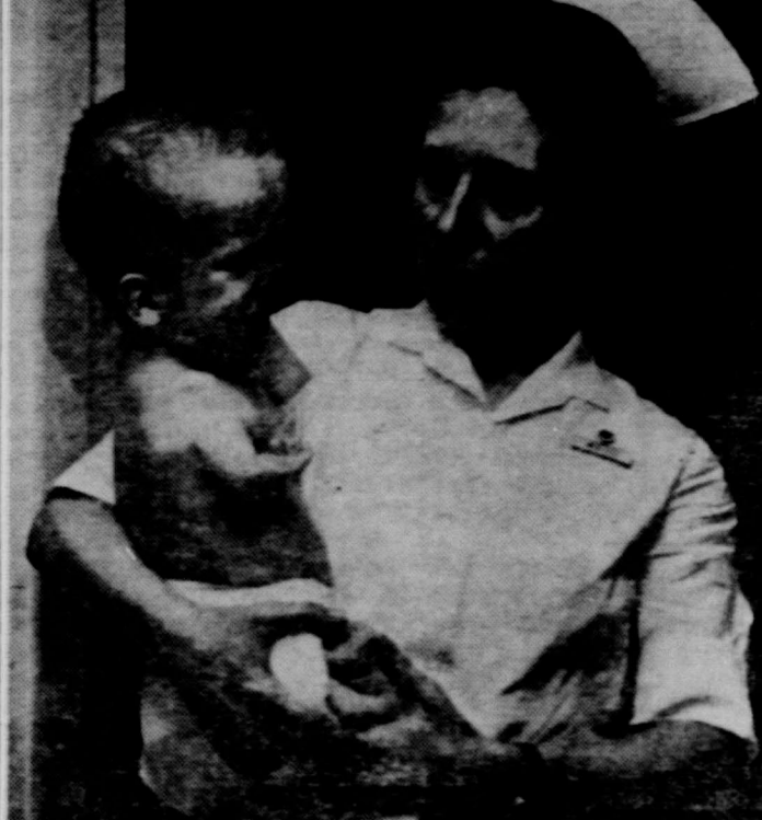
MALFORMED ARMS AND LEGS of a patient at a March of Dimes Birth Defects Center resemble those of thalidomide victims. Scientists suspect that other drugs found in the average medicine cabinet may cause other birth defects.

In its prematal care litera-ure. The National Foundation-March of Dimes, which doctor orders does not do entered the field of birth de- twice as much good. fects after the conquest of Many people are surprised polio, warms all women of that such things as vitamins