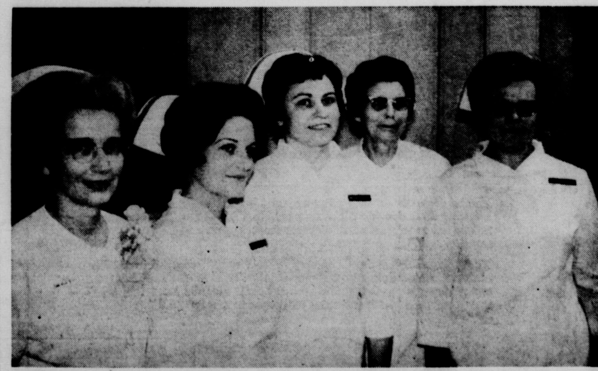
NURSE TRAINEES CAPPED-Pictured above are the three Crowell women who received their nurses' caps in ceremonies at the First Baptist Church Friday night, and their instruc-