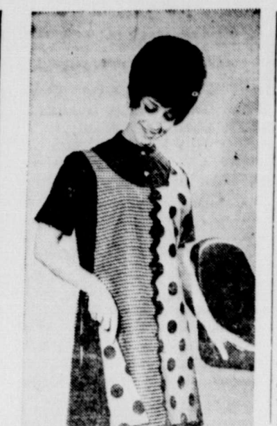
REVERSIBLE-Tops in versatility is the tunic apron with a flip side. Stripes and polka dots in navy and gold cotton team up for one look, while the reverse side is all polka-dots. Giant cotton rick-rack joins the contrasting fabrics in front.