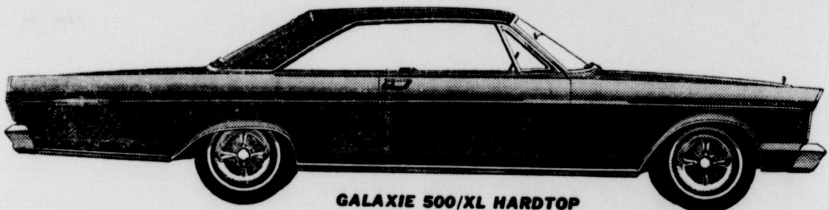
GALAXIE 500/XL HARDTOP

Save now on full-size Galaxies and Customs! Fairlanes and Falcons, even luxury Thunderbirds! Low, low year-end prices! Something for everyone! Finance plans to please your budget! Large stocks—wide choice of models, colors, equipment! Immediate delivery! First come—first served!