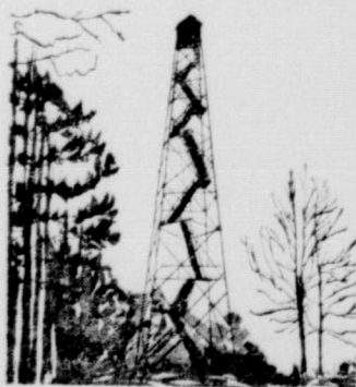
The Texas Forest Service has 81 fire lookout towers located on high ridges throughout the pine-hardwood area of East Texas. These towers, manned during fire weather, help to protect 11 1/2 million acres from forest fires. Each tower is equipped with a two-way radio. Quick communication about the origin of a fire permits speedy suppression.