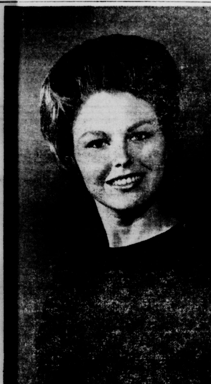
The new look of the Young Married Set

SUBSCRIBE TO THE NEWS $2.55 in Foard and Adjoining Counties; $4.08 elsewhere.