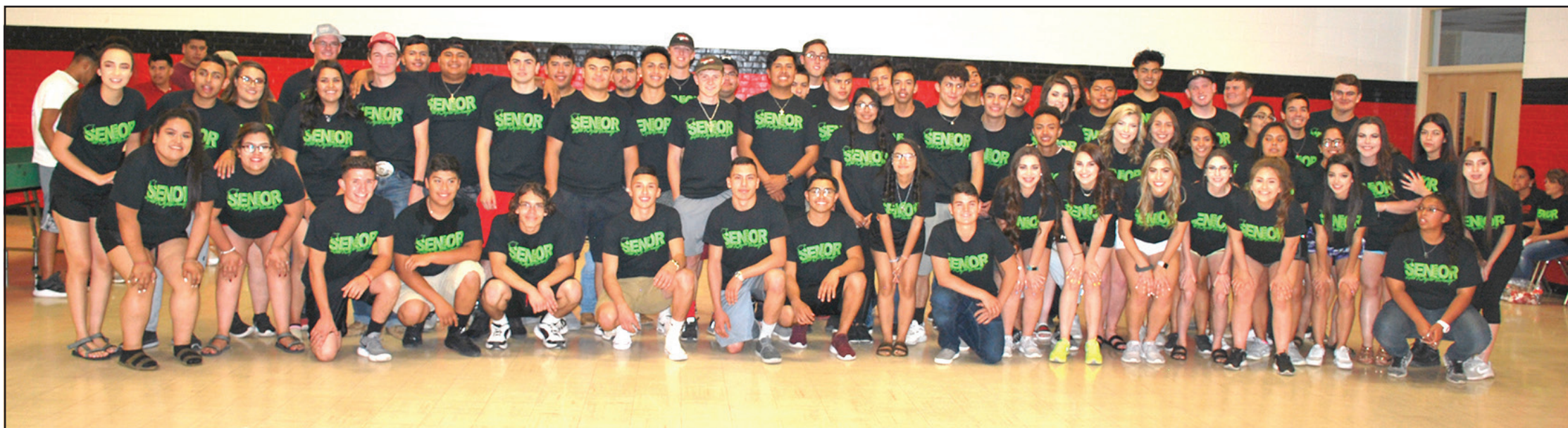
The Senior Class of 2018 would like to thank everyone who donated their time, talent, and money to make the Senior All-Night Party a reality. We love you!!!