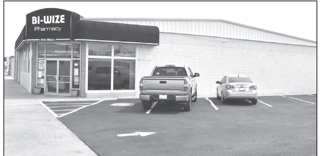
Bi-Wize updated its parking lot this past week with marked parking areas including a spot for special permit parking.

Parmer County Appraisal District P.O. Box 56, Bovina TX 79009 Phone: (806) 251-1405