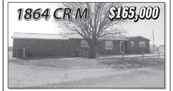
1864 CR M $165,000 REDUCED: 4/2/2 Country Brick Home with barn on 2 acres, metal roof, cent. h&a, fp, basement, septic, fenced yard, nice patio

2/3/2 Brick w/central h&a, fireplace, basement, sprinkler, attic storage, new roof, fenced yard.. SOLD