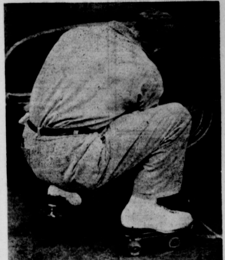
FAST SERVICE —Putting air in a customer's tire, this attendant at a Paris, France, gas station provides fast service by taking care of his duties on roller skates. All attendants at the unusual station on the banks of the Seine River roll happily along during working hours. Skates are used because the gas pumps are a long way from the main building.

Guaranteed typewriter ribbons and carbon papers. Ballinger Printing Co.