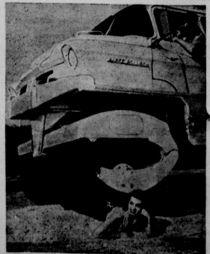
FEELING NO PAIN —Smiling Cindy O'Hara, 18, "Miss International Auto Show," bears up very well under the strain as seven tons of truck rolls over her in San Francisco. The unusual vehicle, which moves on huge, sound-deadening pneumatic pillows instead of conventional wheels and tires, rolls the rollers. On display at the 32nd annual San Francisco International Auto Show, the truck is able to "absorb" road and other bumps (like Cindy) by "floating" around them. It is 100% egg-beat heavy load after very rough ground.