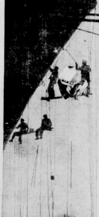
LEFT HANGING—Bugs on strings, workmen juggle from the bow of the liner Caronia at Southampton, England. They're busily painting away as the ship undergoes its annual overhaul.