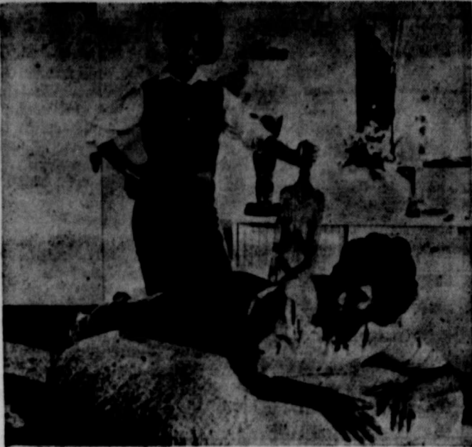
Lovely Susan Cabot is about to take the good ole paddle to one of the pledges in the shock by shock confession of a SORORITY GIRL . This American-International picture can now be seen with MOTORCYCLE GANG on the same bill.

These pictures will be shown at the Horseshoe Drive-In Theatre Friday and Saturday.