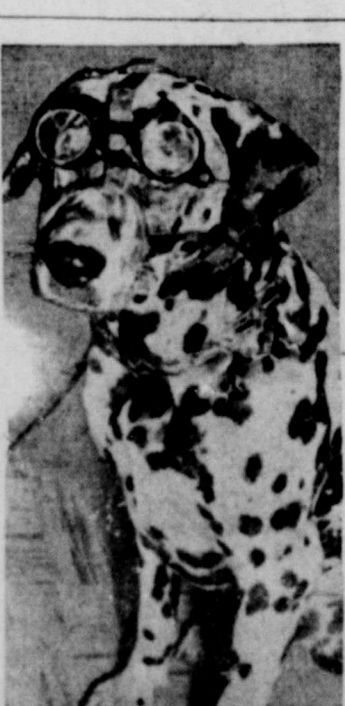
SEEING DOG—Finally getting a good look at the world around him is Apache, a near-sighted Dalmatian. His specially made glasses were fitted by a Chicago optical firm. Held in place by a leather harness, the spectacles enable the myopic canine to see the world around him.