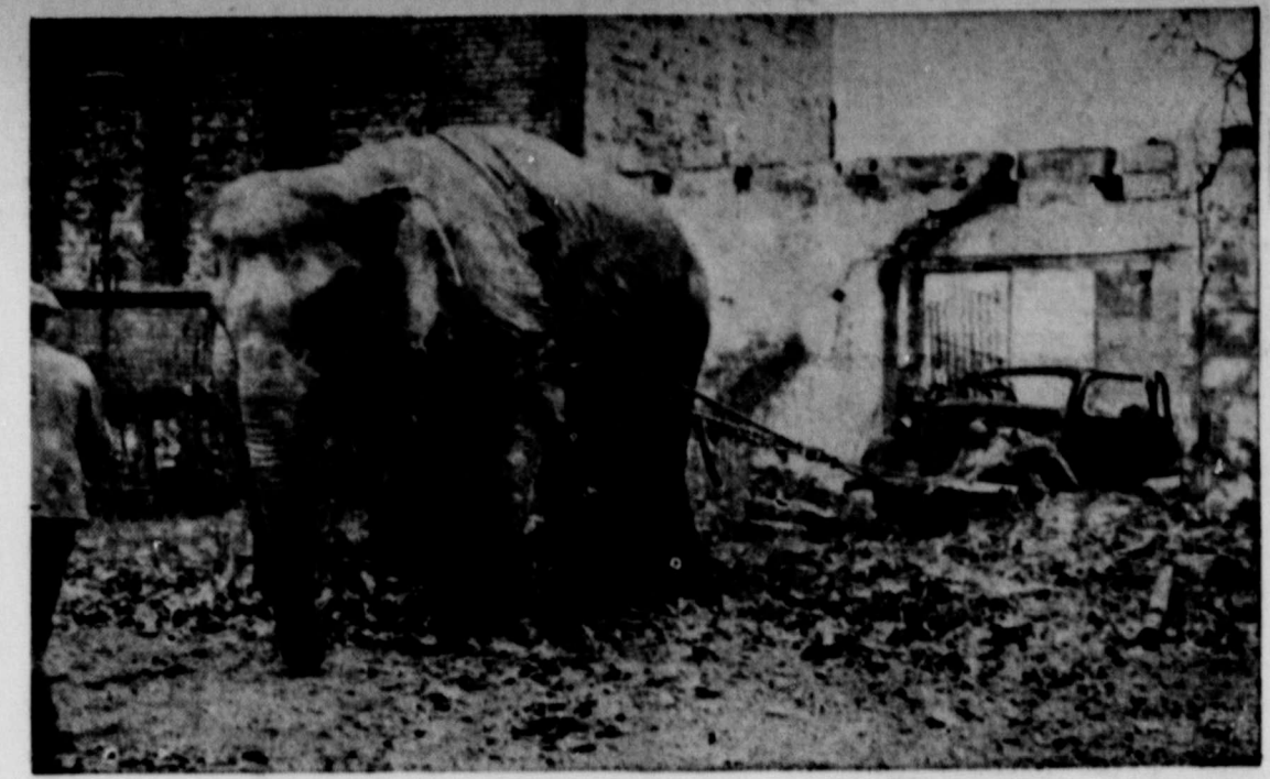
Kieri, 35 years old, is one of the elephants placed into service to aid in the cleaning up of much-bombed Hamburg. Germany. Kieri is being assisted in the job by Many, a 25-year-old mate, barely visible on offside. They are pulling the remains of an automobile from a blitzed building. An elephant can haul 3,000 pounds without much effort, and never seems to tire, even after long hours of work.