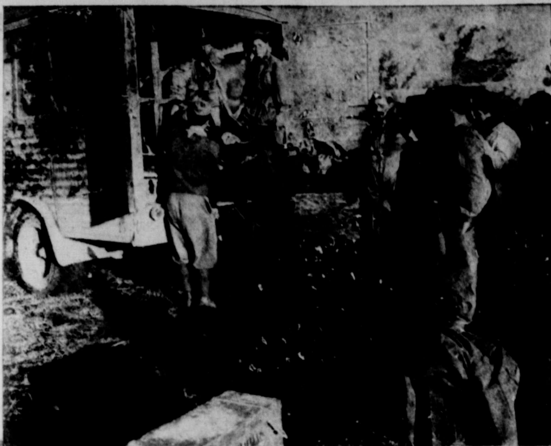
Italian soldiers help load wounded into an ambulance in the Fifth Army's advance on Rome. This is a rugged country of steep hills and mountains and there have been casualties. This wounded man will give the best hospital care in the world. The War Bonds you buy help make this possible.