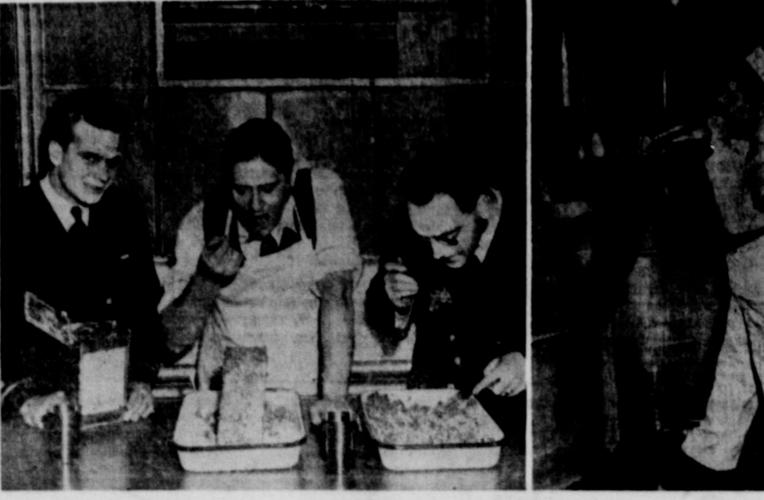
Pictured at the left, officers of the U. S. navy make sure that the rigid standards set for navy food are not lowered. Here they sample corned beef to determine content of fat, gristle and lean meat. This year's navy order for fresh beef amounted to approximately 60,000,000 pounds. Right: this navy cook is ladling fresh peas, an important part of navy chow. During the year ended July 1, the navy consumed about 192,874,500 pounds of fresh vegetables.