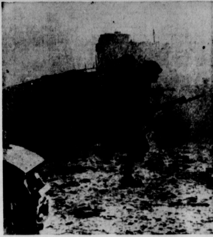
A haze of desert dust raised by advancing tanks and the dry wind of the desert furnishes a grim-laden scene which has obscured men and tanks of the British Scots guards as they advance to attack Field Marshal Rommel's Nazi Afrika Korps on the El Alamein front in Egypt. The desert dust often curtails both Axis and Allied air operations.