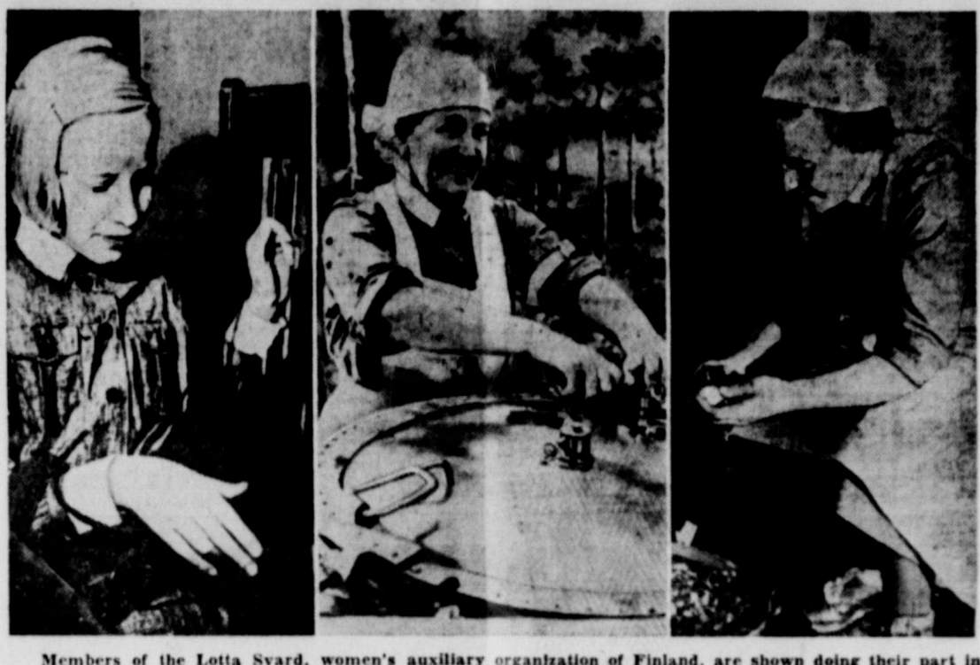
Members of the Lotta Svard, women's auxiliary organization of Finland, are shown doing their part in repelling the Red invasion of their country. At the left a very young member of the highly trained organization prepares a ball of wool for knitting garments. Center: A cook presides over huge cauldrons in which soup is being cooked back of the front lines. Right: Potatoes must be peeled, and another woman aids her country by performing that necessary task.