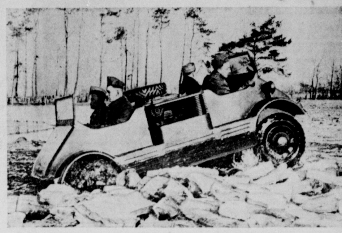
Because of the prolonged cold spell in The Netherlands, it was feared that the great area which was ded as an obstacle to possible invasion, was sufficiently frozen to permit passage of mechanized units Pictured here are the results of a test made by the Dutch army. The amphibian tank, attempting to negotiate a crossing over the flooded area, crashed through the ice and was forced to "swim" for safety

a co-ed comes to college to get B.S." or "B.A." degree, were left Texas recently.