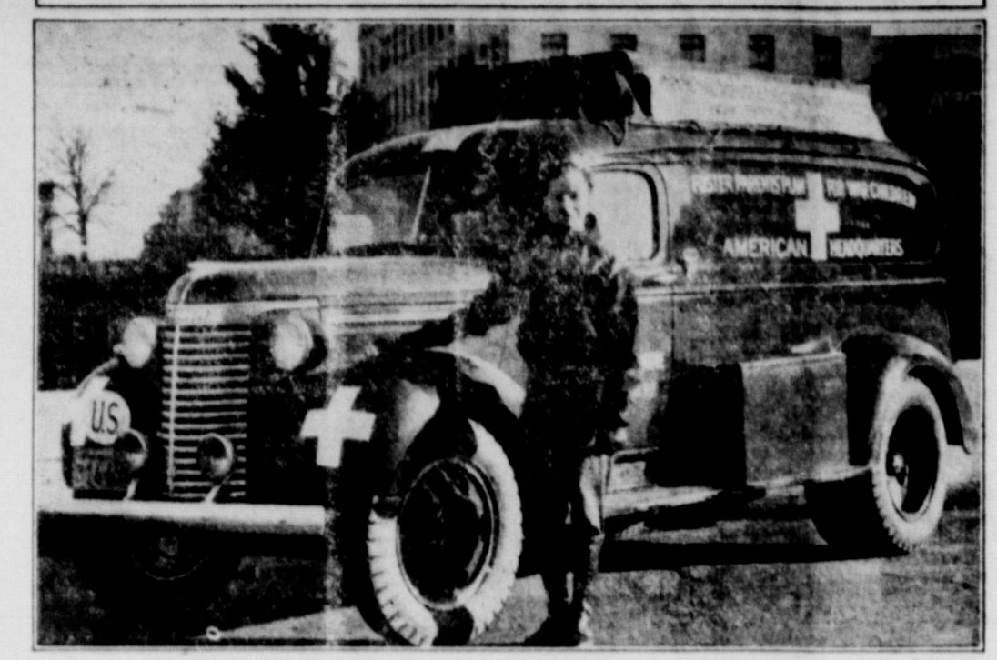
This bus, specially equipped to serve as freight or pas- | fit of children in the bombed areas of Spain, the Foster senger transport, or as a soup kitchen, is the first of several which will be used in France to aid refugee children for whom the Foster Parents' Plan for War Children is cared for in nine colonies near Biarritz, France. Beside caring. It is the gift of friends in America to the refugee children of the world. Originally established for the bene- Plan