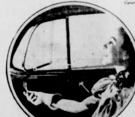
GENUINE FISHER NO DRAFT VENTILATION

(at no extra cost) Proved by more than two million Knee-Action users to be the world's safest, smoothest ride.