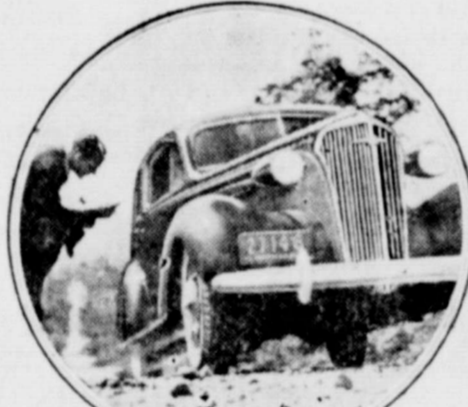
NEW HIGH-COMPRESSION VALVE-IN-HEAD ENGINE

Much more powerful, much more spirited, and the thrift king of its price class.