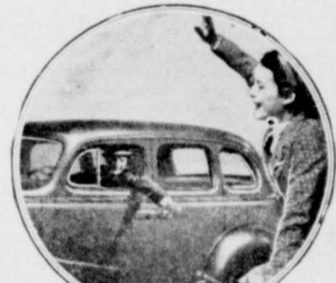
PERFECTED HYDRAULIC BRAKES

Making this new 1937 Chevrolet the smartest and most distinctive of all low-priced cars.