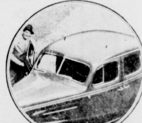
NEW ALL-SILENT, ALL-STEEL BODIES

(With Double-Articulated Shoe Linkage) Recognized everywhere as the safest, smoothest, most dependable brakes ever built.