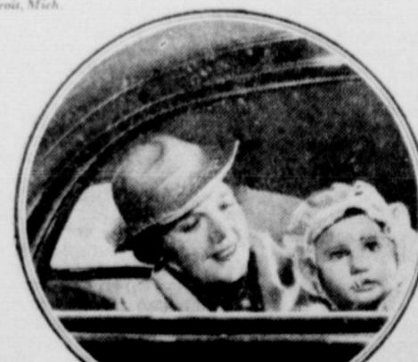
SAFETY PLATE GLASS ALL AROUND

(at no extra cost) Steering so true and vibrationless that driving is almost effortless.