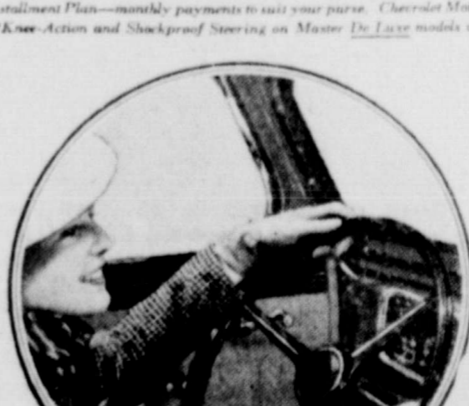
SUPER-SAFE SHOCKPROOF STEERING*

Eliminating drafts, smoke, windshield clouding—promoting health, comfort, safety.