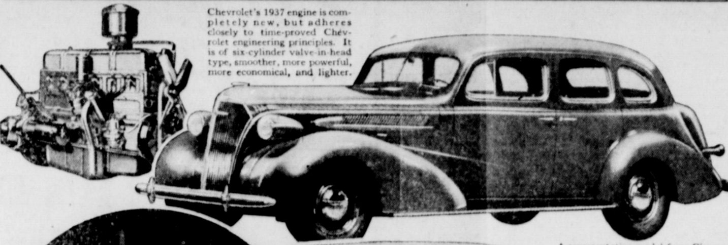
Chevrolet's 1937 engine is completely new, but adheres closely to time-proved Chevrolet engineering principles. It is of six cylinder valve-in-head type, smoother, more powerful, more economical, and lighter.