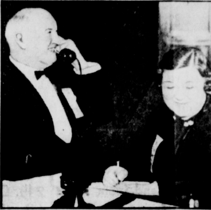
Buoyant, making good on his prediction that even Kansas would go Democratic, Chairman James Farley is shown here as he received the news of Roosevelt's landslide trend in Democratic headquarters, New York City. Previous to election, Farley at no time would concede more than two states to Governor Landon in the historic race.