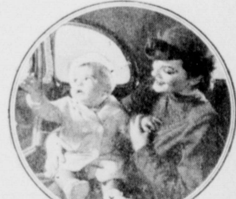
IMPROVED GLIDING KNEE-ACTION RIDE*

(at no extra cost) Proved by more than two million Knee-Action users to be the world's safest, smoothest ride.