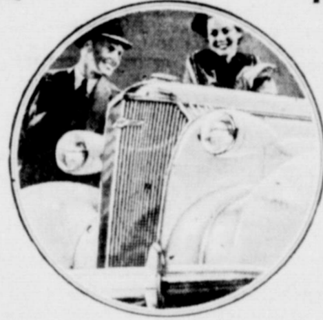
NEW DIAMOND CROWN SPEEDLINE STYLING

Much more powerful, much more spirited, and the thrift king of its price class.