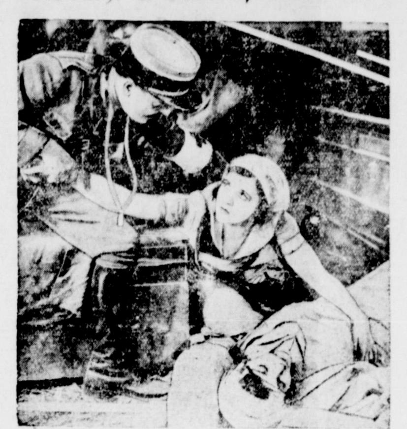
MARIE PREVOST and ZASU PITTS in "WAR NURSE"