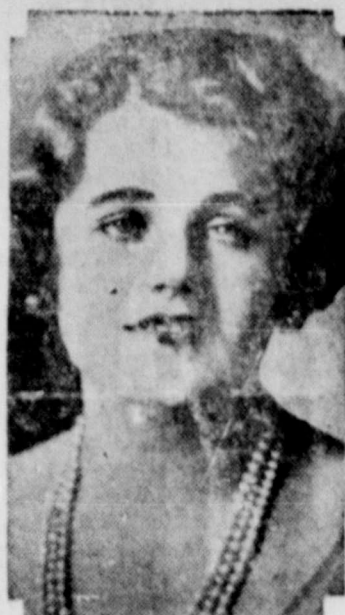
Madame Maria Jeritza, Austrian opera singer, instituted legal proceedings in Vienna charging defamation of character against the brilliant Austrian writer, Dr. Muller Guttenbrunn.