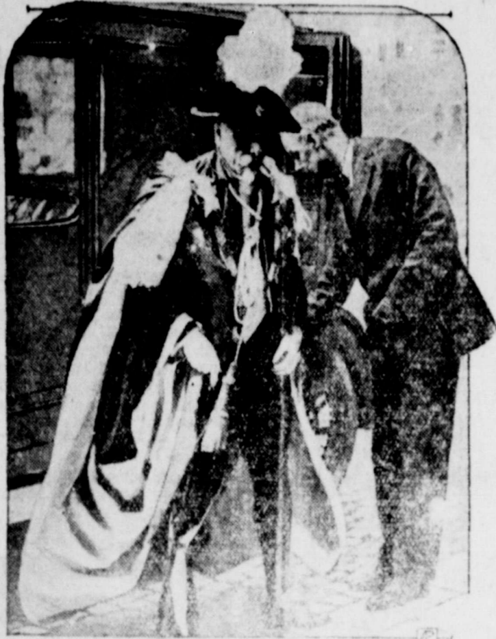
Sir Basil Zarahoff, "mystery man of Europe," is shown in his full regalia as an English knight.