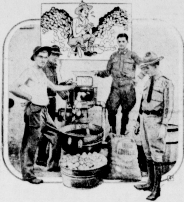
Peeling potatoes by hand has been found too costly and wasteful, so this machine skin 'em at a rate of 10 minutes to the 100-pound sack.

(By Associated Press) CHICAGO, Nov. 14.—The World War veteran who did some of his campaigning against a stack of potatoes with a peeling knife as a weapon should see how they uncover the "spud" today. The machine age has relieved the "k. p." of his most obnoxious task. An efficiency expert found that hand peeling was too costly, so a machine now does the job. Each regiment of the Illinois national guard has a peeling machine. The company "k. p.'s" bring along their potatoes, dump them in the hopper, and carry them back to the cook shack—peeled. Peeling "spuds" under the old