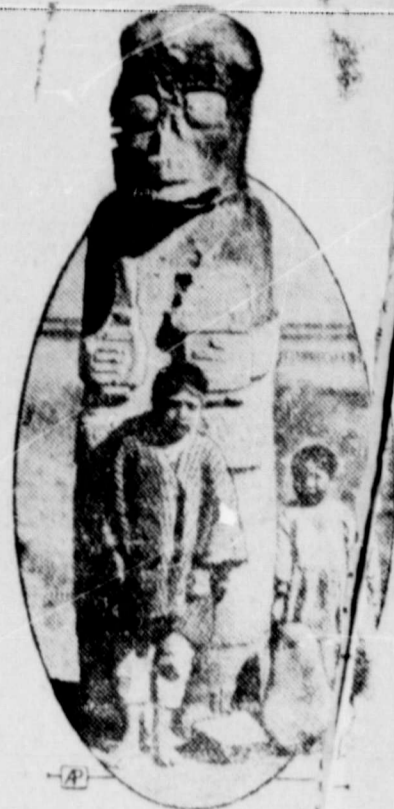
Gnomon of the Sun temple of Tihuanacu, Bolivia. It is a sun dial.

POSDAM, June 21.—Of all ruined prehistoric cities "half as old as time," the most ancient is undoubtedly Tihuanacu in Bolivia, on the banks of Lake Titicaca, where stand the remains of the great pre-Inca sun temple of Kalasasaya, relic of a civilization that flourished many centuries before Christ.