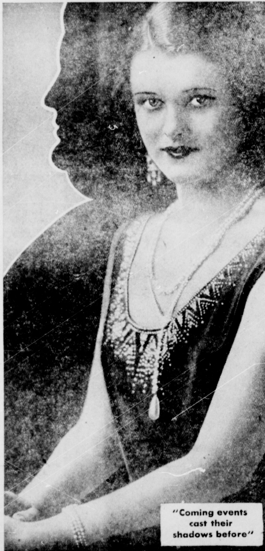
"Coming events cast their shadows before"

Lucky Strike, the finest Cigarette you ever smoked, made of the finest tobacco—The Cream of the Crop—"IT'S TOASTED." Lucky Strike has an extra, secret heating process. Everyone knows that heat purifies and so 20,679 physicians say that Luckies are less irritating to your throat.