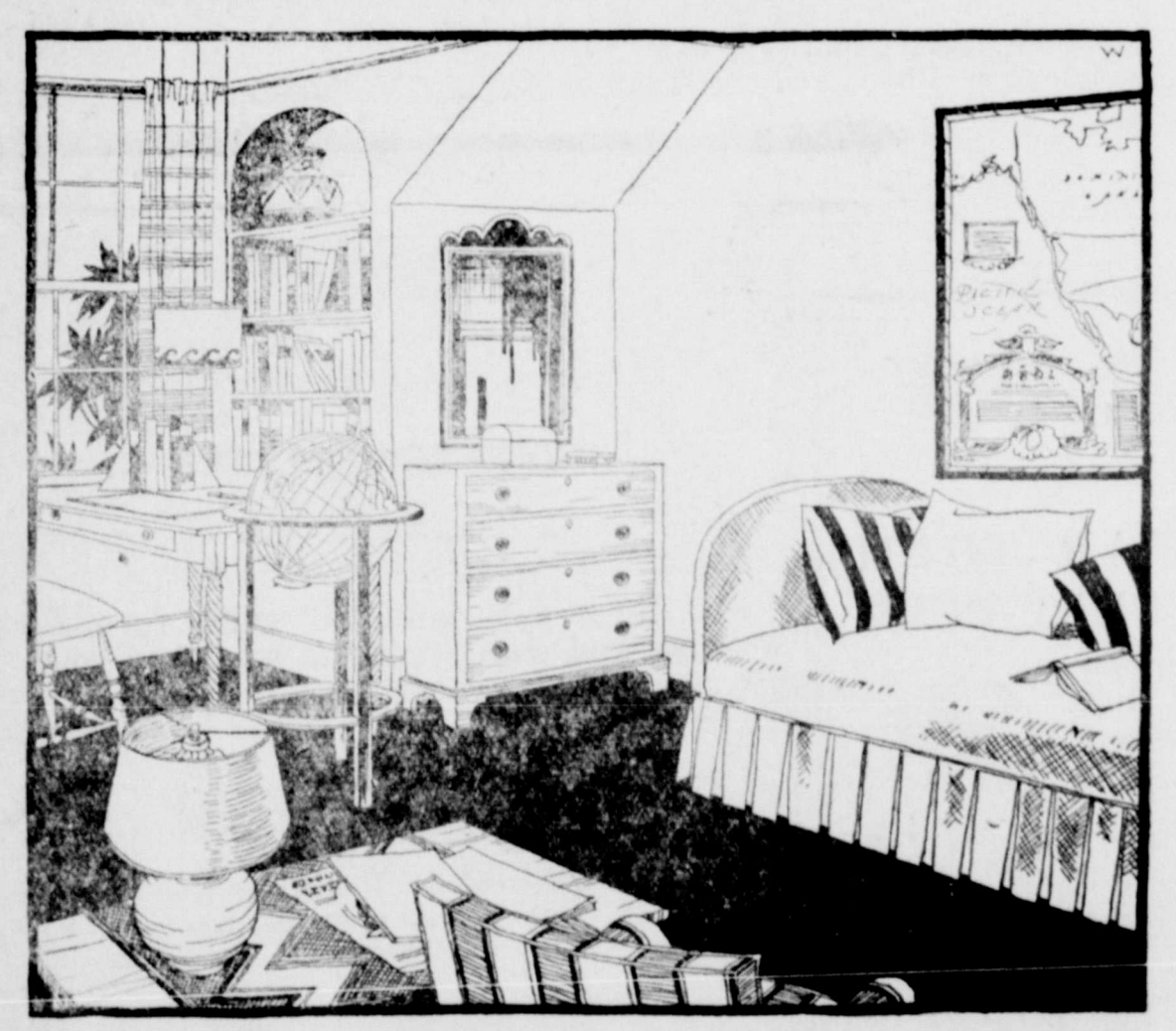
Pastel shades and flowery effects don't especially please the boy