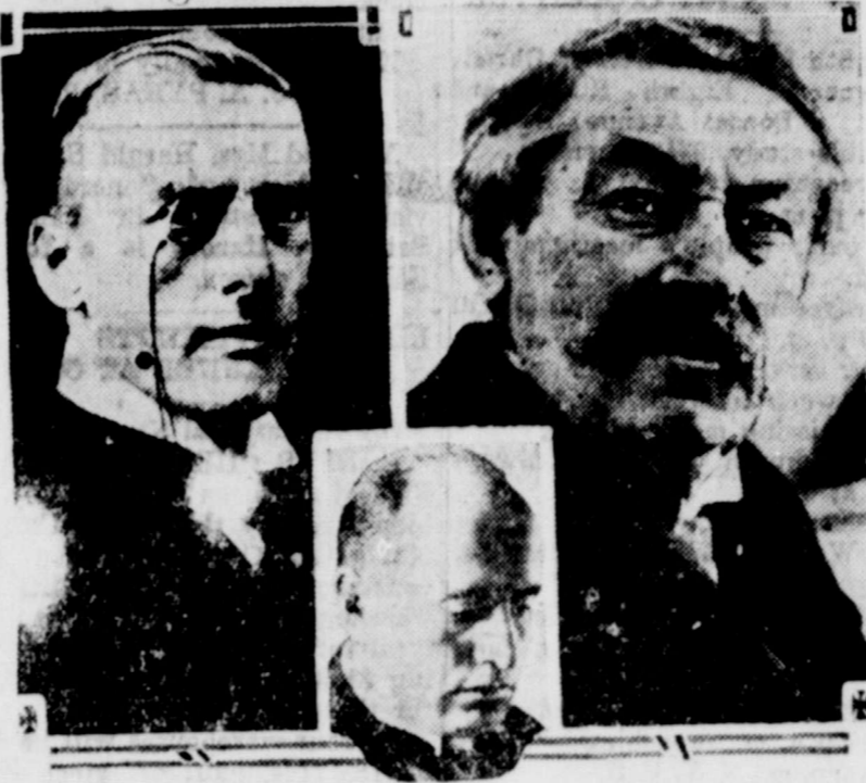
Sir Austen Chamberlain (left), Aristides Briand (right), and Benito Mussolini (center), may come together in peace session that will have important bearing on European political affairs.

Premier Mussolini has accepted the olive branch. The symbol, tendered by Aristides Briand, foreign minister of France, will lead to a meeting between the two statesmen that will clear up the somewhat strained Franco-Italian situation. What's more, Sir Austen Chamberlain, England's foreign minister, will probably be a third party to this important conference. The Duce is in favor of the session. He has informed the Italian Chamber that all points of friction should be wiped away.