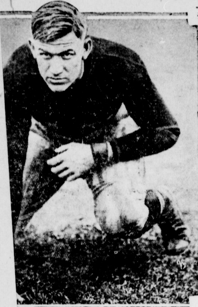
gue of Dallas, Texas, who was one of the best lines-Point team, is to captain the gliders next year at the (International Union, dated ...)