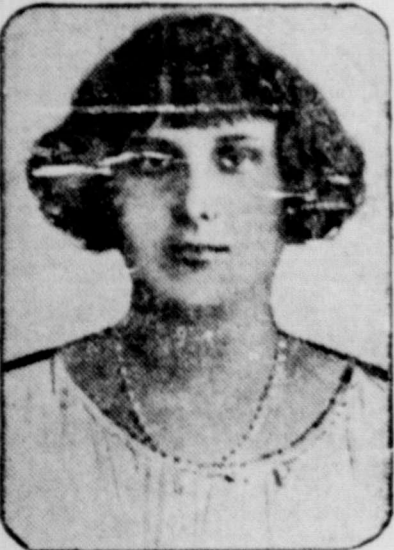
THE INFANTA CHRISTINA OF SPAIN

(By Associated Press) MADRID, Spain, August 27.—The Queen of Spain has had her way again. Her second daughter, the Infanta Christina, is letting her hair grow to its full length. It was bobbed in her childhood, but as the Infanta approached her debut into society, made this year, her mother thought it