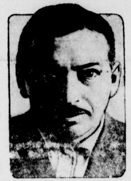
M. P. TOMSKY MOSCOW, Aug. 9.—Michael Tomsky, chairman of the All-Russian Council of Professional Unions, an organization of eight million members, has been elected as "honorary sharpshooter" by the Supreme Council of Physical Culture. Tomsky has contributed to the "militarization" of Soviet professional unions during the present war scare of Russia, particularly by promoting rifle practice, by an energetic campaign in the press and fiery speeches.

EDINBURG, Tex.—Edinburg's beautiful Southern Pacific passenger station opened for business recently. A picture of the new station is being used on all dining car menus on the Southern Pacific Lines throughout the United States.