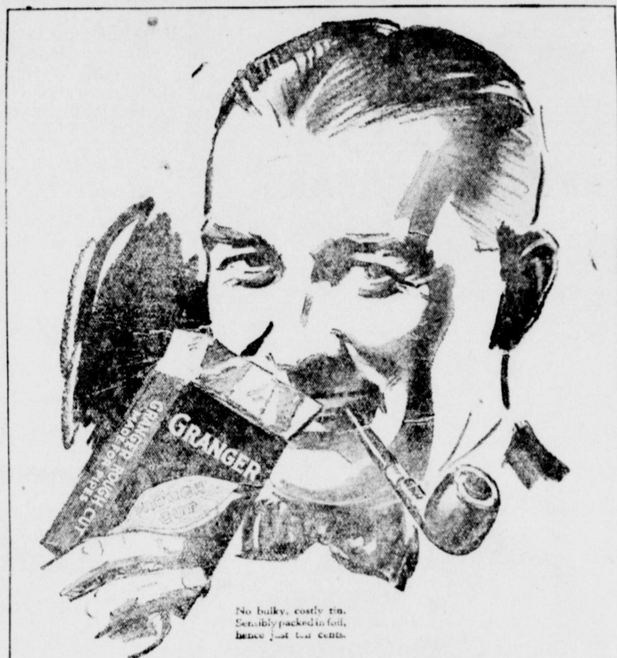
No bulky, costly tin. Sensibly packed in foil, hence just two cents.

"How can they sell such corking tobacco at such a price?"