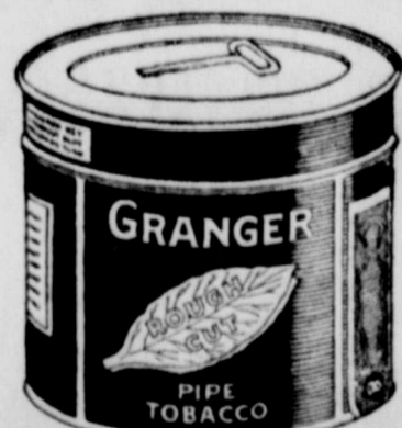
This half-pound vacuum tin is forty-five cents

GRANGER ROUGH CUT IS MADE BY THE LIGGETT & MYERS TOBACCO CO.