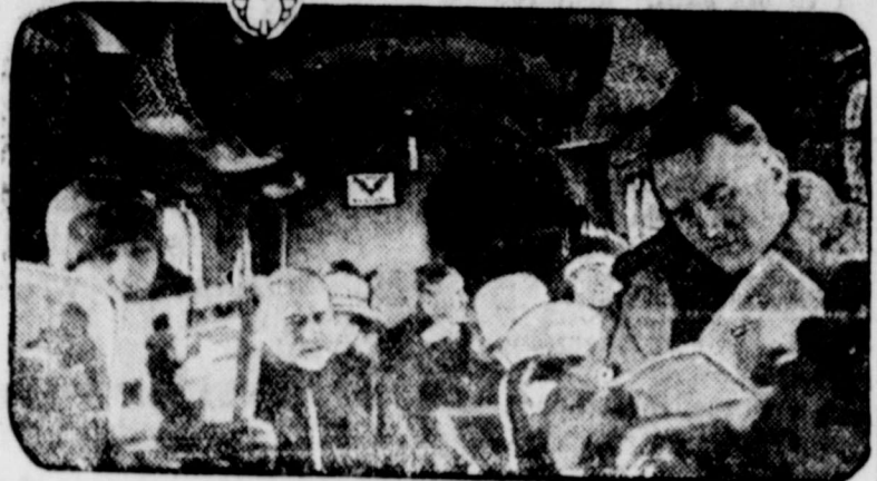
Top—An omnibus meets all arriving airplanes and within 15 minutes deposits passengers at downtown hotels. Lower—Interior of a German passenger airplane, showing comfortable appointments.

The former drill grounds of the imperial army, the Tempelhofer Field, have provided a starting and landing place within 15 minutes from the commercial heart of Berlin. Alighting at the aerodrome from an omnibus of the "Lufthansa," which picked him up at his downtown hotel, the passenger is greeted by "air boys" and escorted into an