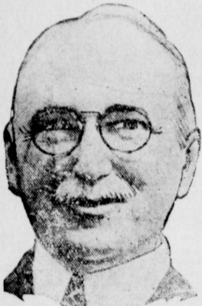
WALLACE R. FARRINGTON

(By Associated Press) HONOLULU, T. H., July 6.—A luncheon club speech made Wallace Rider Farrington governor of Hawaii.