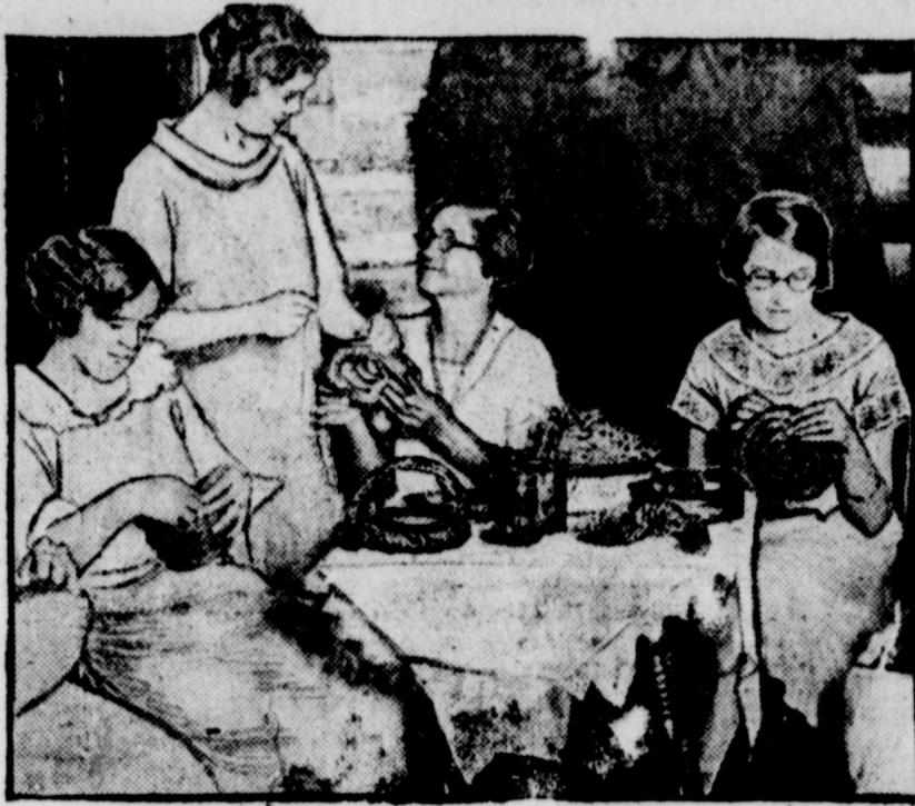
Group of Southern women weaving native grasses into baskets.

In more than twenty states girls have organized handicraft associations, have their own exhibit and sales rooms. They prepare more or less standardized models of baskets suitable for all sorts of uses from the florist's baskets to those for the sewing room.