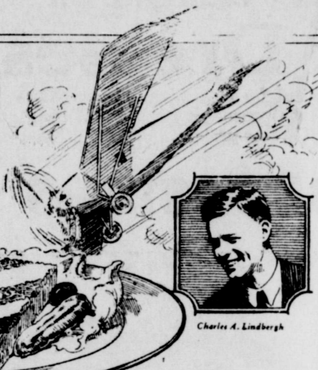
Charles A. Lindbergh

Canned SALMON is the best food value at the lowest cost of anything in cans.