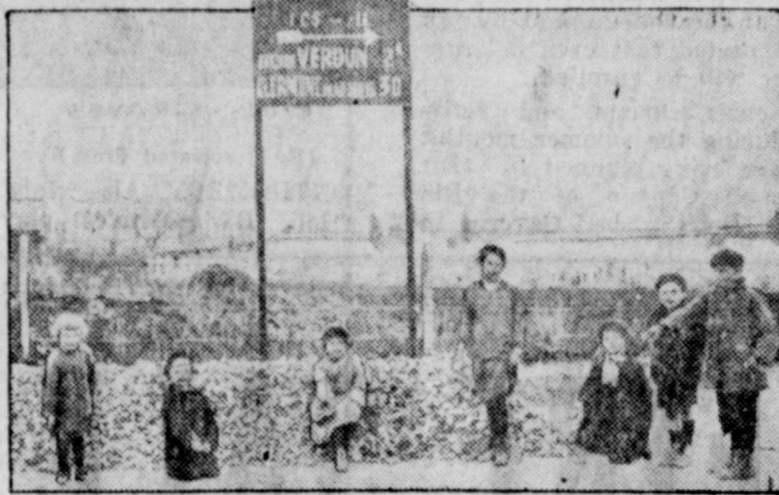
VERDUN CHILDREN PLAYING IN THE SHADOW OF A FRENCH MILITARY CEMETERY.

(Associated Press Legion Series) VERDUN, France, July 7.—So thick are cemeteries in Verdun, greatest burial field of the World War, that playgrounds for children are difficult to find. The Verdun children play like those the world over, but their games often are within sight of the wooden crosses marking the graves of soldiers, Allied or Germans, 400,000 of whom were killed in the long and intense