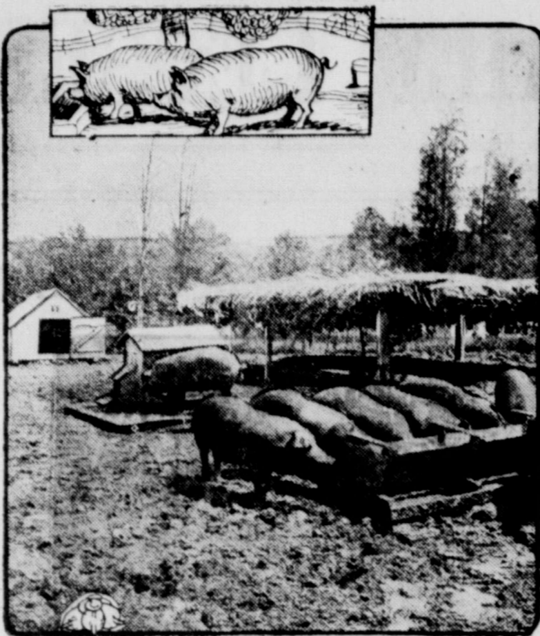
"Contented hogs." They have warm houses for winter and a shaded pool for the summer.

Life is what somebody else makes it, if the hog could tell his side of the story.