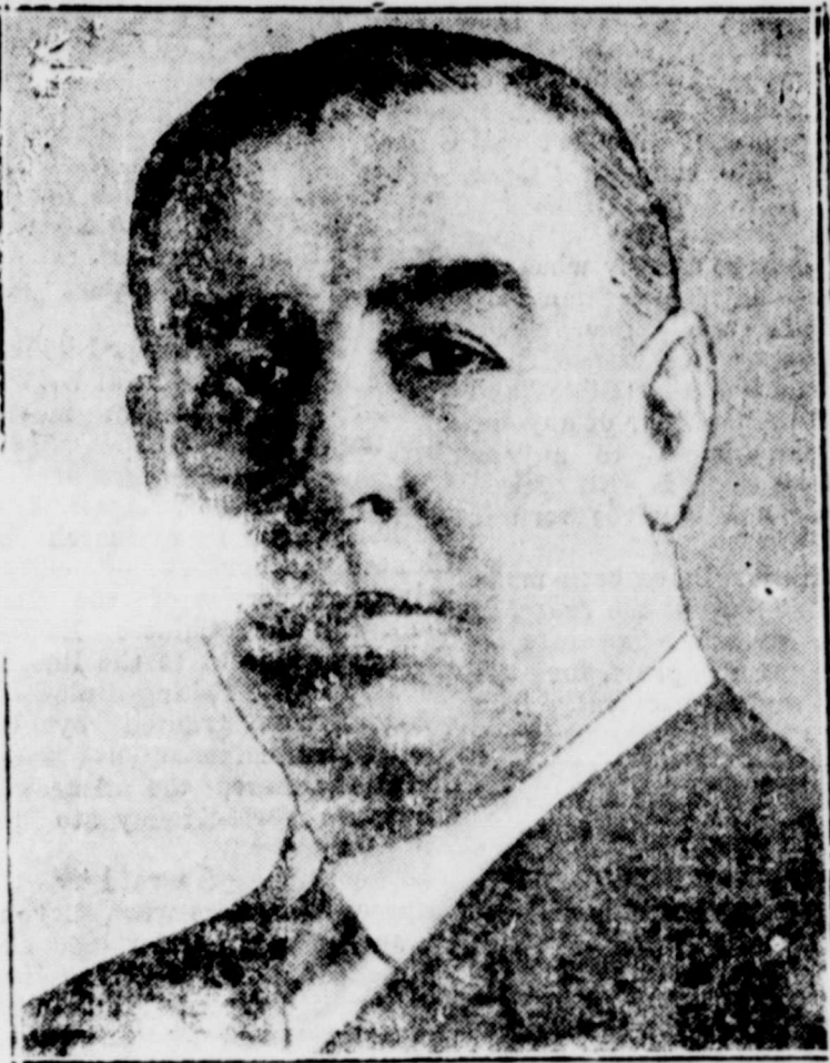
William H. Thompson

"Big Bill" is mayor of Chicago again. William Hale Thompson, robust and picturesque Republican executive of the nation's second city from 1915 to 1923, has emerged from a four year retirement to wrest the office from William E. Dever, Democratic incumbent. "Big Bill," native of