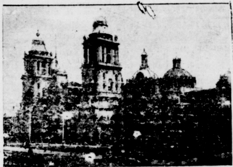
THE CATHOLIC CATHEDRAL, MEXICO CITY

MEXICO, D. F., March 18.—Holy Week without church services by Catholic priests will be known in Mexico for the first time this year.