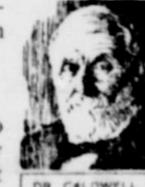
DR. CALDWELL'S SYRUP PEPSIN

For a free trial bottle send name and address to Pepsin Syrup Company, Monticello, Illinois.