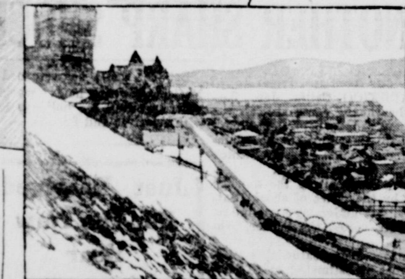
DUFFERIN TERRACE TOBOGGAN SLIDE

Quebec perched high up on a rock overlooking the majestic St. Lawrence with quaint old buildings sprawling on the hill where they had to halt before the tidal walls affords a lovely background for sport enthusiasts residing in their blanket coats and striking sport costumes. The frosty air and sparkling snow colored by myriad beams of light, add to the beauty of Quebec in winter. An atmosphere of festivity pervades the entire city, but the center of all the winter sports is the Chateau Frontenac where the Carnival spirit is at its height and reacts on visitors and citizens alike, as the Mardi Gras in New Orleans; pleasure, comradeship of the great-outdoors, and joviality are the keynote of the hour. The winter sports season of 1927