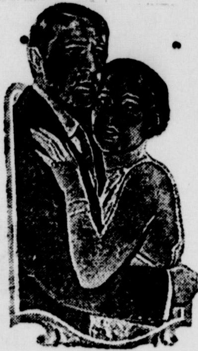
Aileen Pringle in "Wildfire"

"Chickie," Great Serial, Filmed as Feature, Tomorrow at Queen Theatre