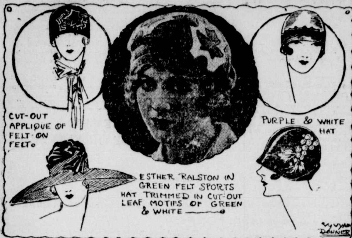
PURPLE BANGKOK, & PURPLE VELVET TRIM.