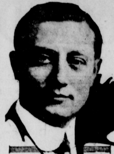
CONGRESSMAN MARTIN L. DAVEY

KENT, O.—National prosperity depends largely on rebuilding forest wealth, according to Congressman Martin L. Davey, head of the Davey Tree Expert Company. To interest children in this work, Congressman Davey has offered a $4,000 scholarship in any Ohio college to the Ohio high school boy or girl who writes the best essay of 500 words on forest conservation. The contest is in charge of the Ohio Federation of Women's Clubs.