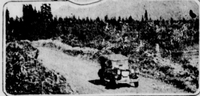
ON SUMMER TRAILS

CHICAGO — Announcement by the Sinclair Refining Company that it has developed an anti-knock gasoline containing no ingredient that does not come out of an oil well, is pleasant news for car owners in this summer season when thousands of motor gypsies are crowding the nation's trails. This development, it is said, is the result of more than a year of experimentation in the research laboratories of the company's East Chicago refinery.