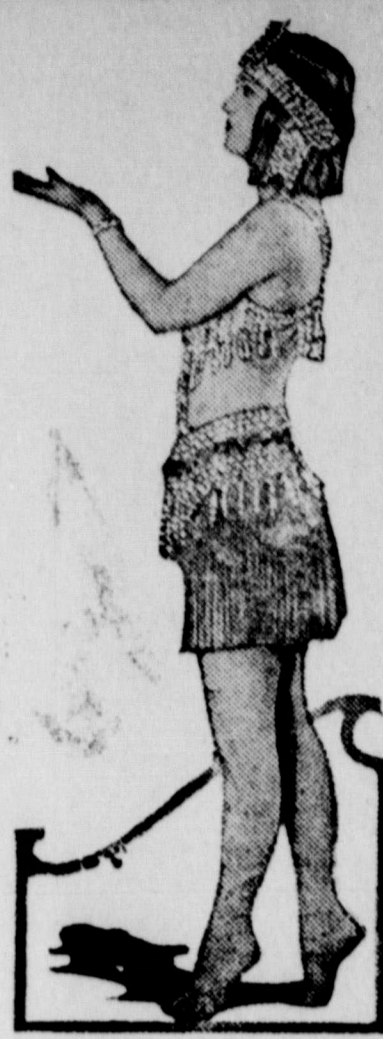
Betty Arlen, one of the chorus girls in "Pretty Ladies," who attracts her perfectly formed legs & classic dancing.

At Lytle Beach, Abilene, Monday night, July 27th, there will be a special dance from 9:00 till 2:00 with music by Drapers Seven Serenaders. Admission $2.50 per couple. d 24-1tw