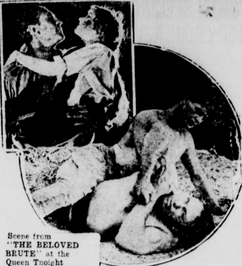
Scene from "THE BELOVED BRUTE" at the Queen Theatre

We learn that ribbed materials are very much in favor for coats and coat frocks. Among the newer fabrics of this nature are Cote Dehlin and Coto Triton.