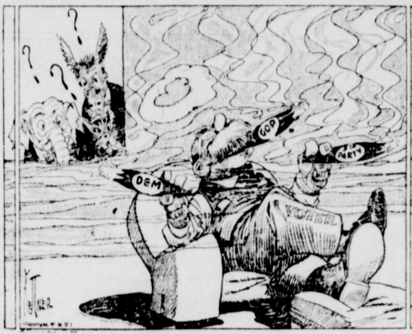
The Smoke Screen