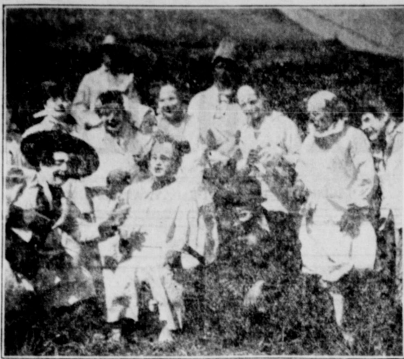
A group of fun makers with Golden Bros. Trained Animal Show, Ballinger, Saturday, April 12.