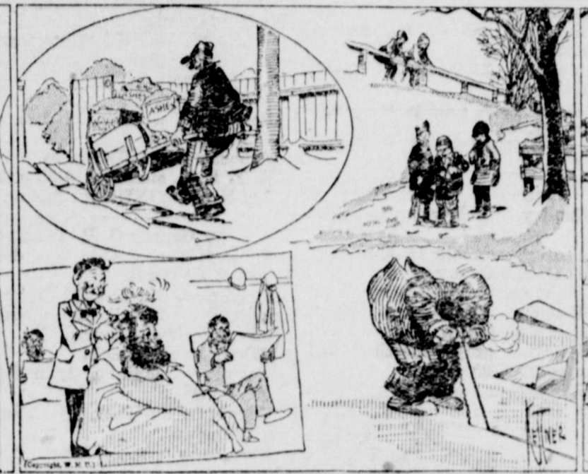
Harvesting the Winter Crops

(By Associated Press) PITTSBURGH, Feb. 16.—Five convicts were held for murder today by a coroner's jury which heard the evidence in the inquest into the deaths of two prison guards. The guards were killed during a riot at the Western Penitentiary last Monday.