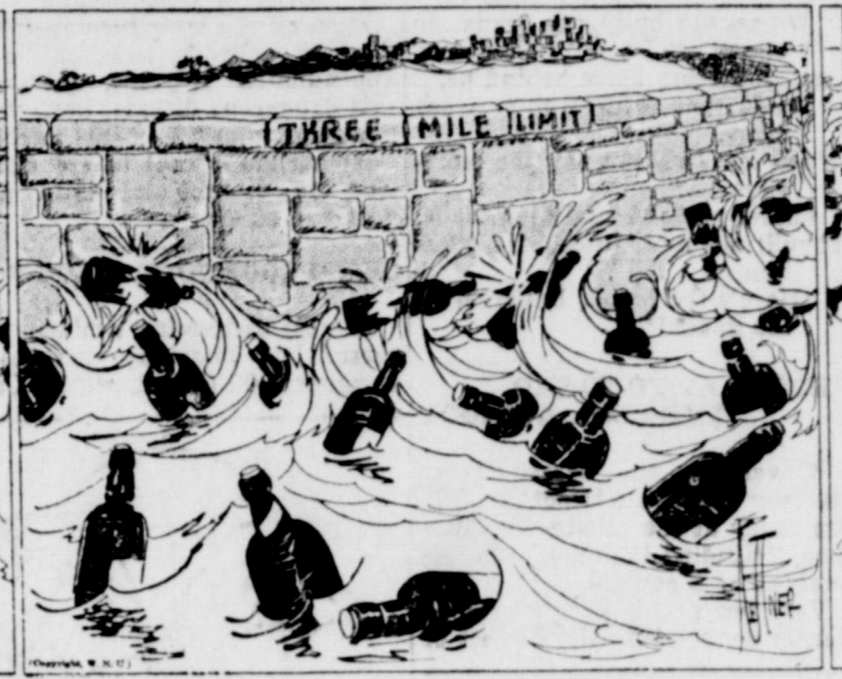
The Sea Wall