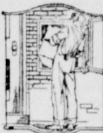
Outside Icing Convenience and 26 other Herrick features described in free booklet

Long ago we saw the many conveniences of such a feature. We realized their importance to the housewife. And so for years we have been building prize-winning Herricks with the outside icing feature when desired.