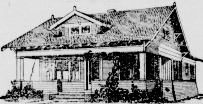
Plan No. 156

A drizzling rain here Sunday night and Monday morning gave temporary relief from dust which had been unusually bad in the city and along the public highways. Heavy travel on the highways and lack of moisture to settle the dust for the past several weeks had caused clouds of dust to form. The drizzle may stop cotton picking for a time, but the rain has not been heavy enough to damage cotton, or put out any water. Only a light sprinkle at Ballinger, with a heavier sprinkle at some other places in the county, was reported.