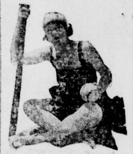
VIOLA DANA All set for a game of ball on the beach at Santa Monica. The cameraman says that if baseball were solely a matter of form Viola would head the league.