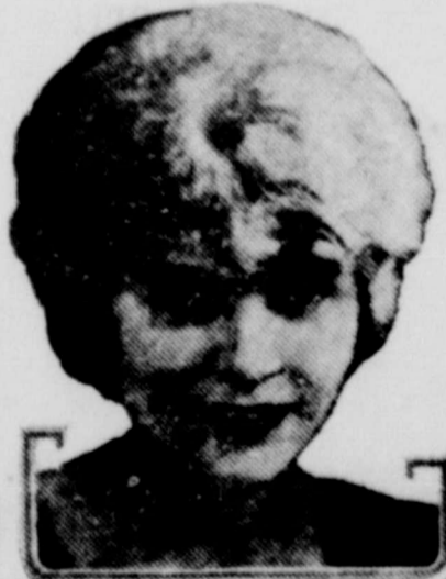
BLANCHE SWEET IS BACK

A small want ad in The Daily Ledger often saves you money.