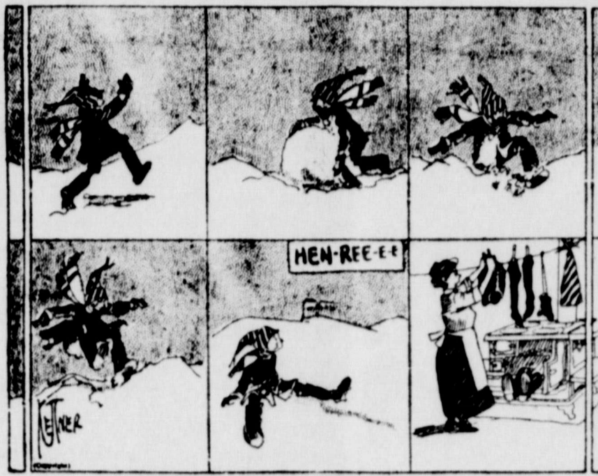
The End of a Perfect Day