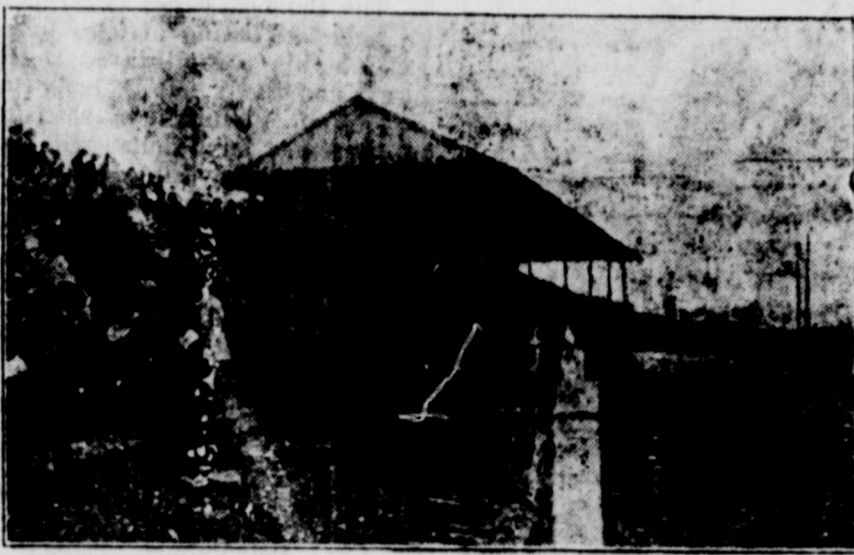
Scene at big grandstand of State Fair of Texas during auto race, showing tremendous crowds that follow the most modern of all sports.